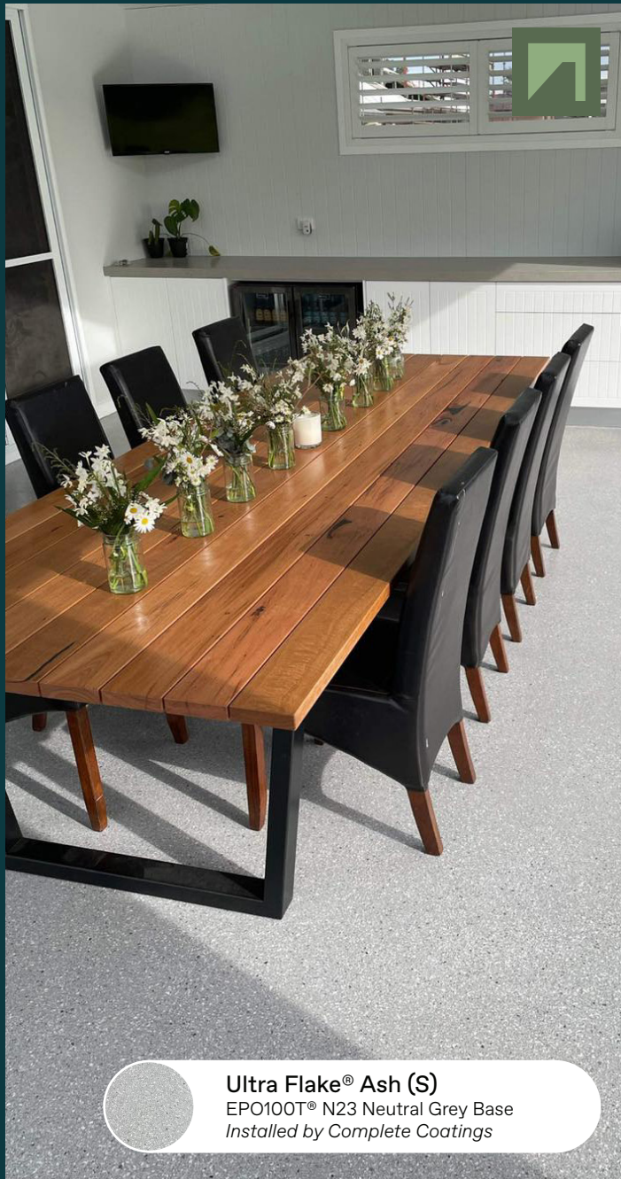
Ultra Flake® Ash (S) EPO100T® N23 Neutral Grey Base Installed by Complete Coatings

Due to its range of colour options, Ultra Flake® systems have become a desirable and competitive modern flooring alternative to carpet and tiles.