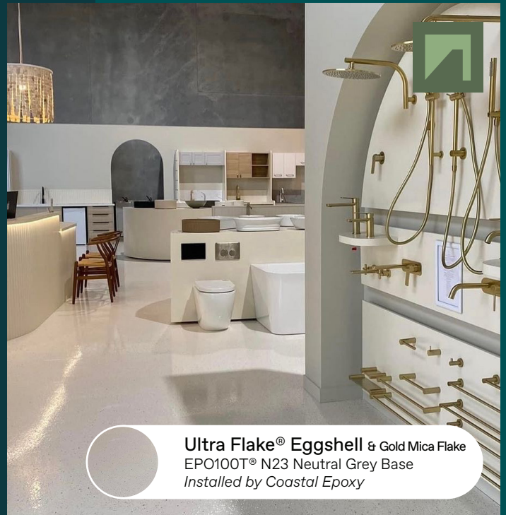
Ultra Flake® Eggshell & Gold Mica Flake EPO100T® N23 Neutral Grey Base Installed by Coastal Epoxy