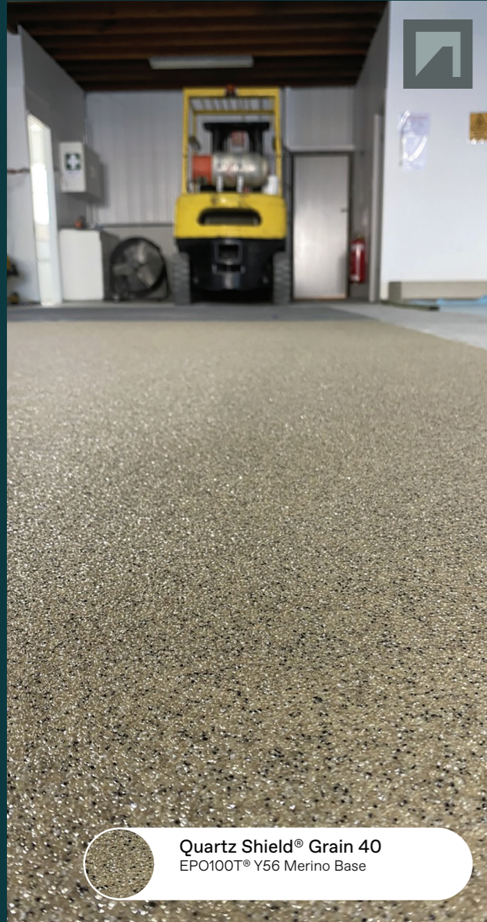
Quartz Shield® Grain 40 EPO100T® Y56 Merino Base

The applications and benefits are perfectly complemented by a dynamic colour range including, Arctic, Grain, Iron, Silver and Wine. These colours further increase the appeal of this system and confirm Quartz Shield® as a choice for businesses and asset owners.