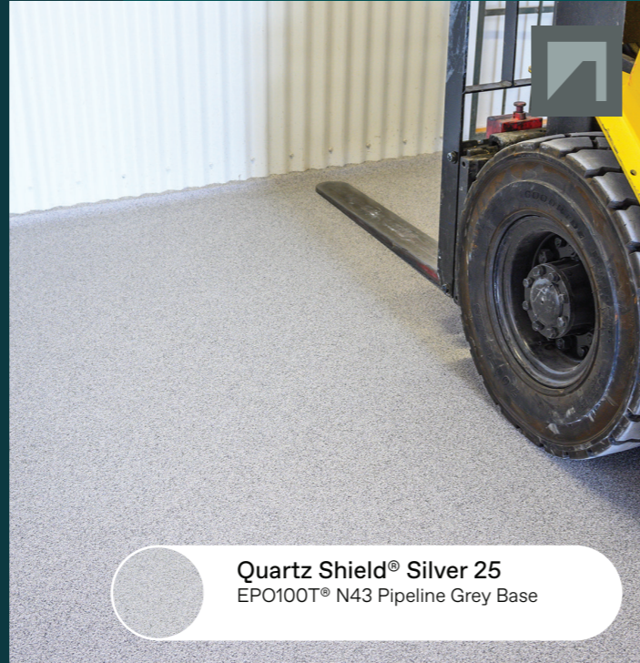
Quartz Shield® Silver 25 EPO100T® N43 Pipeline Grey Base