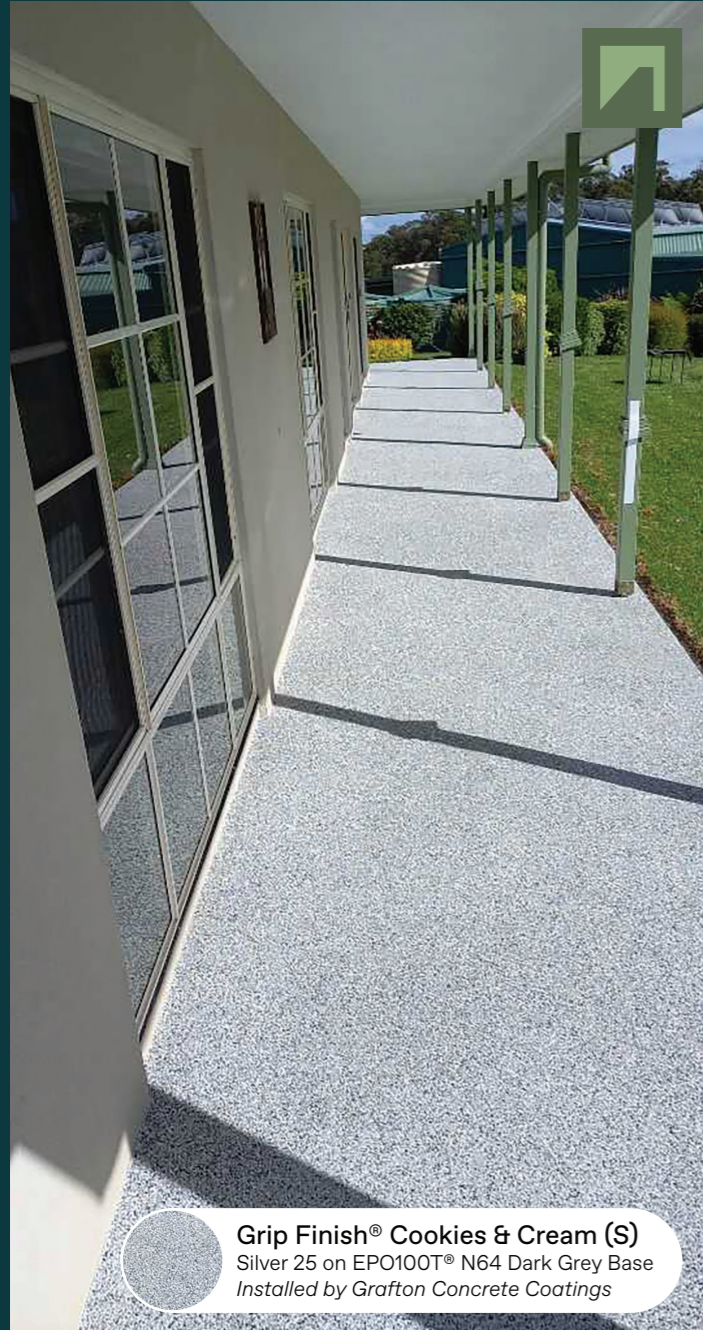
Grip Finish® Cookies & Cream (S) Silver 25 on EPO100T® N64 Dark Grey Base Installed by Grafton Concrete Coatings

Hard wearing, mould resistant and hygienic, this finish is the perfect way to stand out from the neighbours and know you have a flooring system you can count on for years to come.