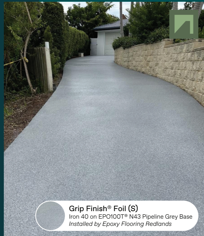
Grip Finish® Foil (S) Iron 40 on EPO100T® N43 Pipeline Grey Base Installed by Epoxy Flooring Redlands