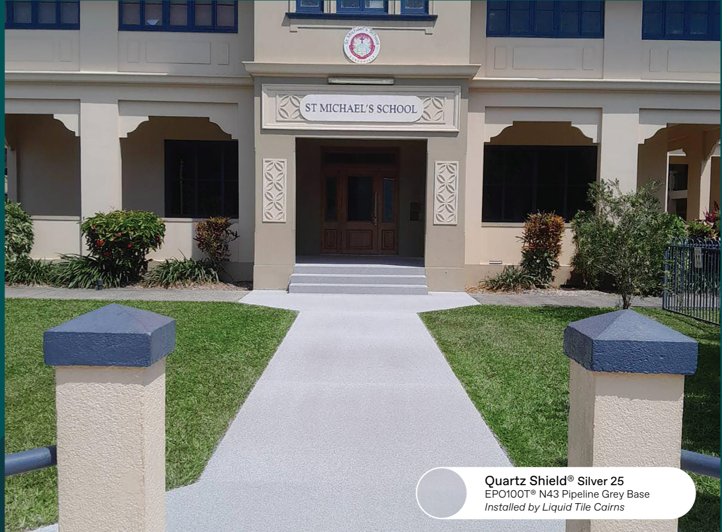
Quartz Shield® Silver 25 EPO100T® N43 Pipeline Grey Base Installed by Liquid Tile Cairns