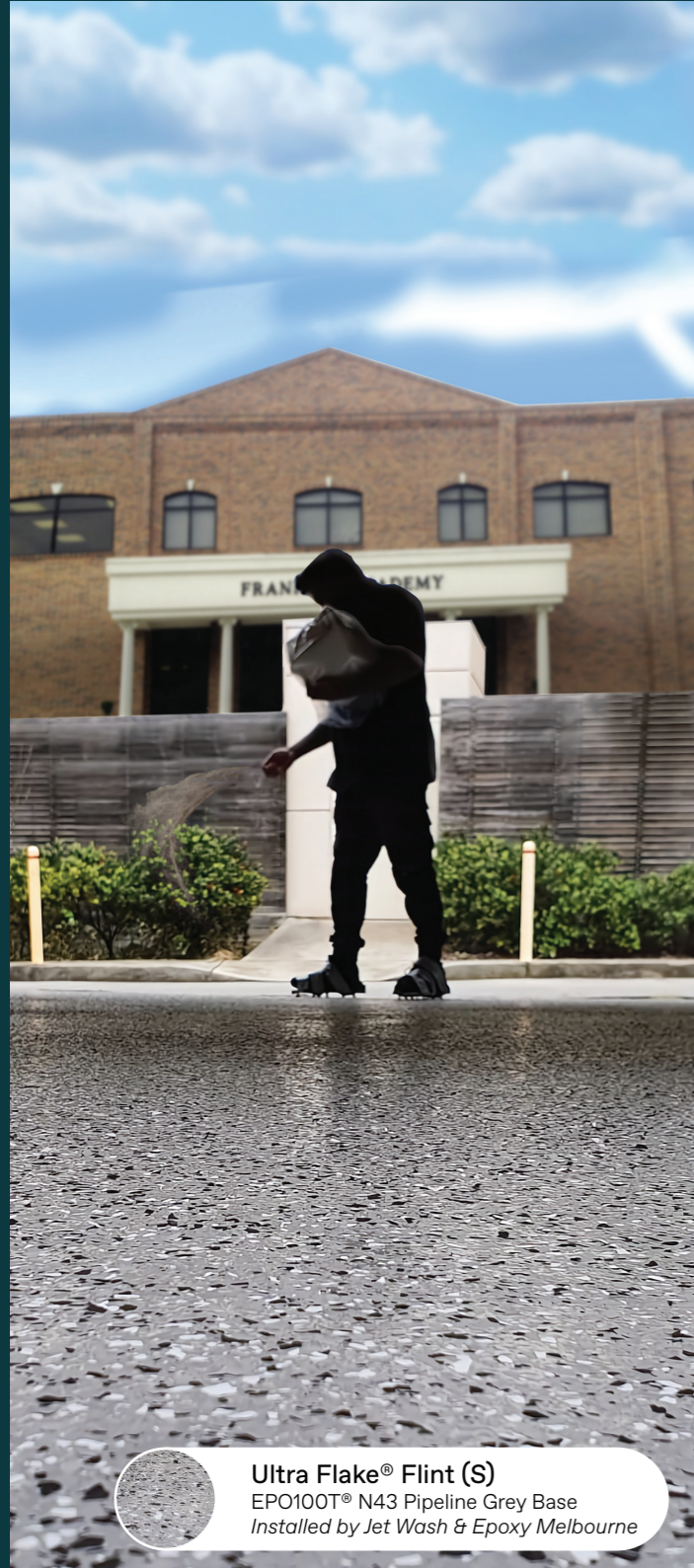
Ultra Flake® Flint (S) EPO100T® N43 Pipeline Grey Base Installed by Jet Wash & Epoxy Melbourne

All Purpose Coatings have a full range of Australian Manufactured and APAS (Australian Paint Approval Scheme) approved products that meet or exceed Australian Standards.