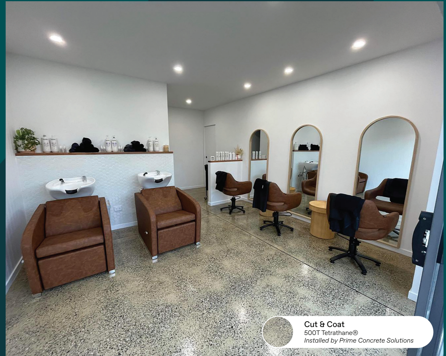
Cut & Coat 500T Tetrathane® Installed by Prime Concrete Solutions