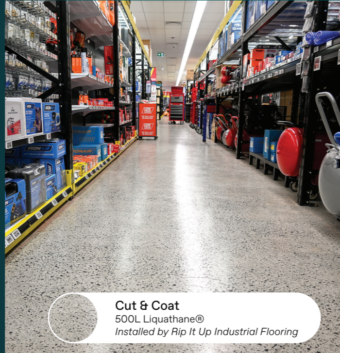
Cut & Coat 500L Liquathane® Installed by Rip It Up Industrial Flooring