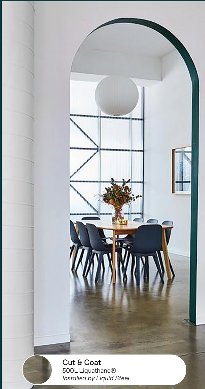
Cut & Coat 500L Liquathane® Installed by Liquid Steel

Different products can be used to achieve a range of finishes, including high-gloss, semi-gloss, and matte.