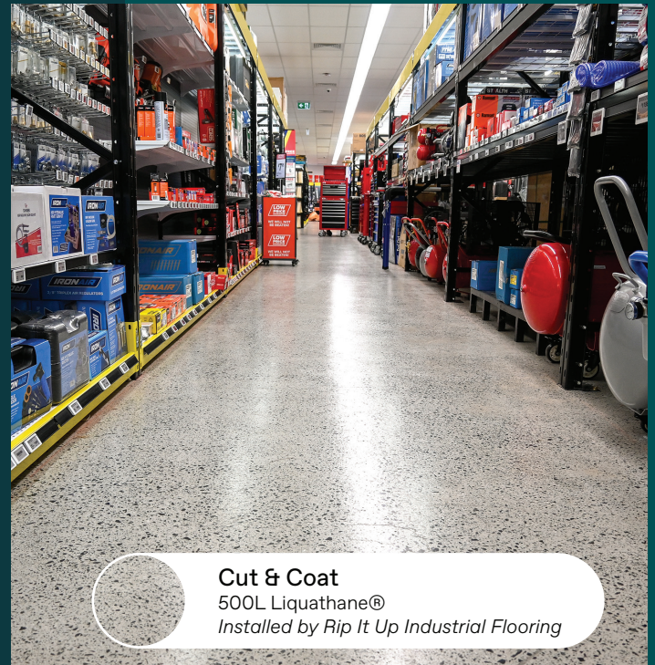
Cut & Coat 500L Liquathane® Installed by Rip It Up Industrial Flooring