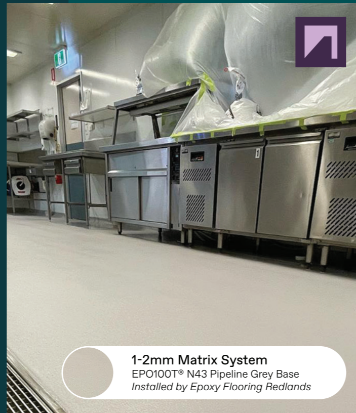
1-2mm Matrix System EPO100T® N43 Pipeline Grey Base Installed by Epoxy Flooring Redlands