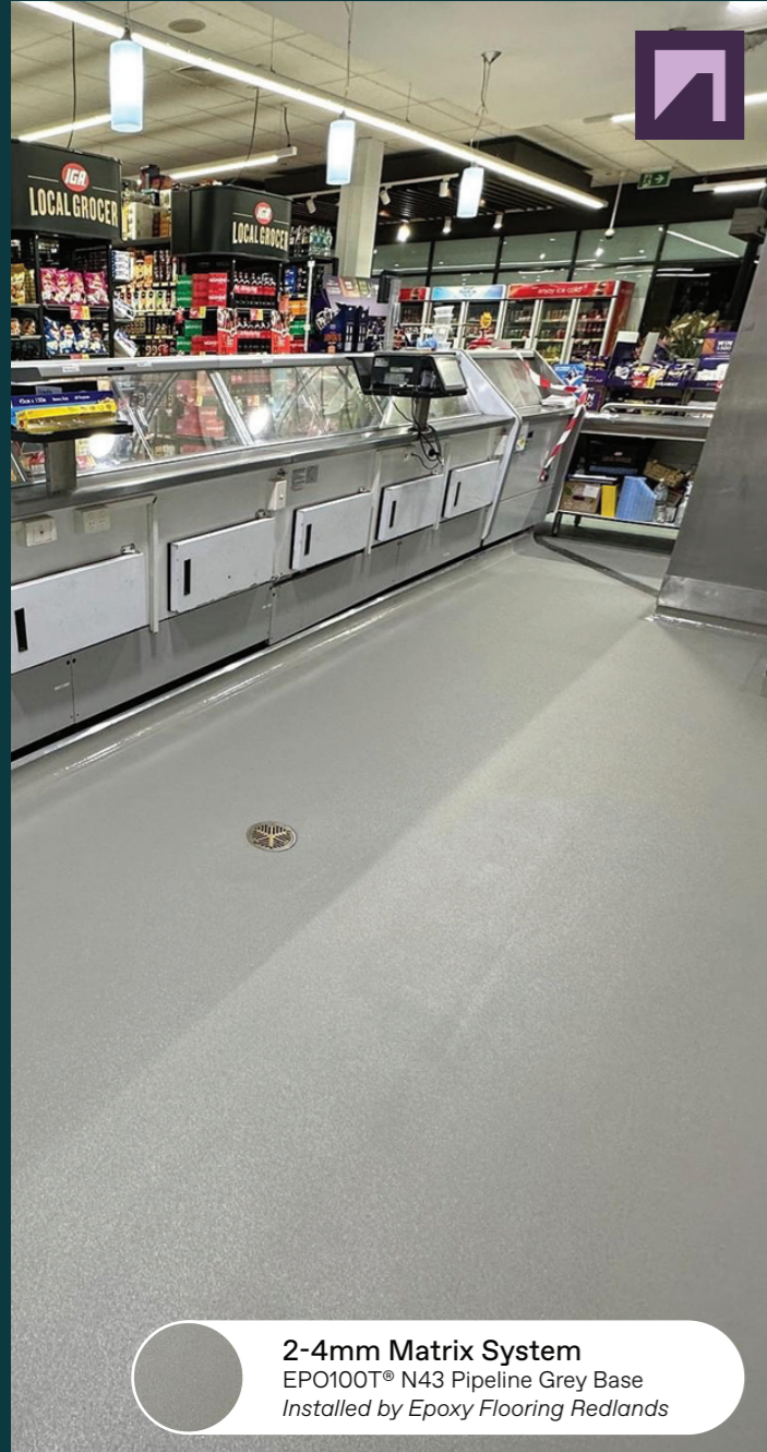
2-4mm Matrix System EPO100T® N43 Pipeline Grey Base Installed by Epoxy Flooring Redlands

Epoxy Matrix Systems are used within commercial and industrial spaces including commercial kitchens, wet areas, abattoirs, food preparation and manufacturing areas as a long term floor and wall coating solution.